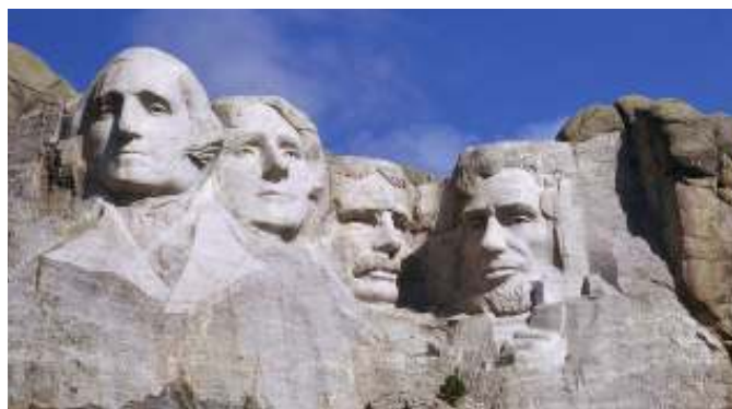
President's/George Washington Birthday Holiday—Feb 16