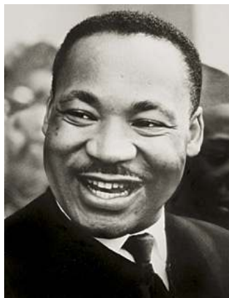
Martin Luther King, Jr. Holiday - January 19